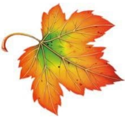
The Little Flower Maternity Home

PO Box 270181 Louisville, CO 80027 (720) 609-2934 www.littleflowermaternity.org